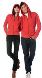
B&C Hooded Full Zip /women & /men